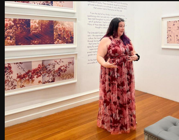
The Untended Garden Exhibition Cedar House Gallery, Savannah, GA