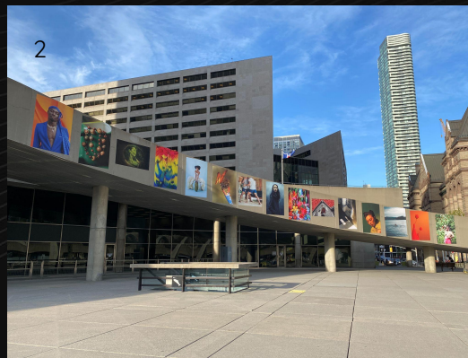
2) Scotiabank CONTACT Toronto 2022 - Shine On - Photographs from the BIPOC Mentorship Program