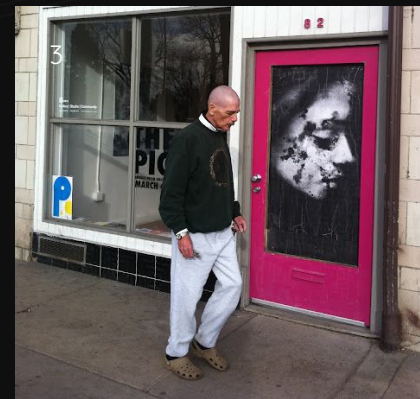
3) Denver Month of Photography - The Big Picture wheat paste images in action