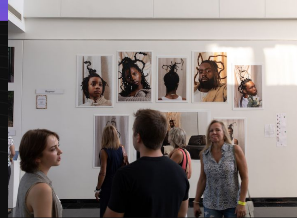
CCS Student Exhibition - Crowns