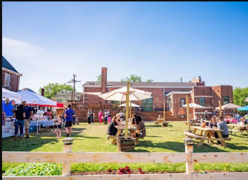
Outdoor Space - The Congregation, Detroit