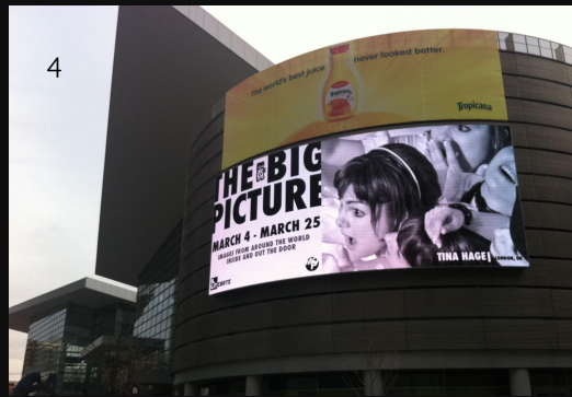
4) Denver Month of Photography - The Big Picture Downtown Denver Theater District on video billboard